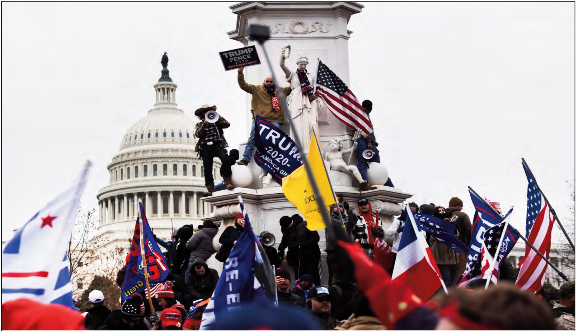
Trump supporters gather outside the US Capitol building following a Trump rally on January 6.