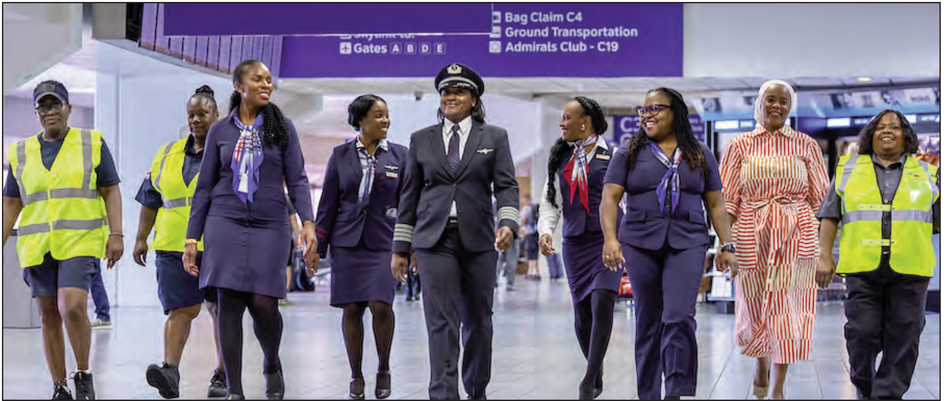
American Airline's All-Black Female-Headed Flight Crew