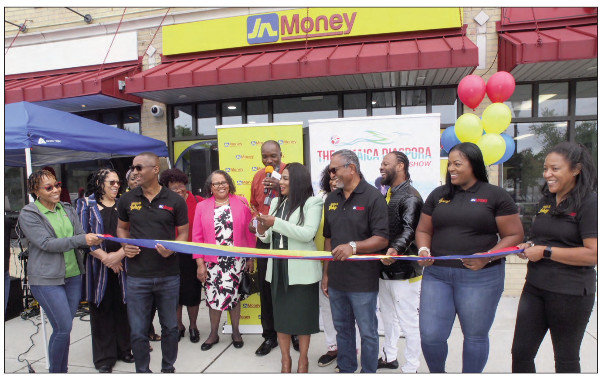
Ribbon-Cutting Ceremony at opening of the expanded JN Money Store facility on AlbanyAvenue