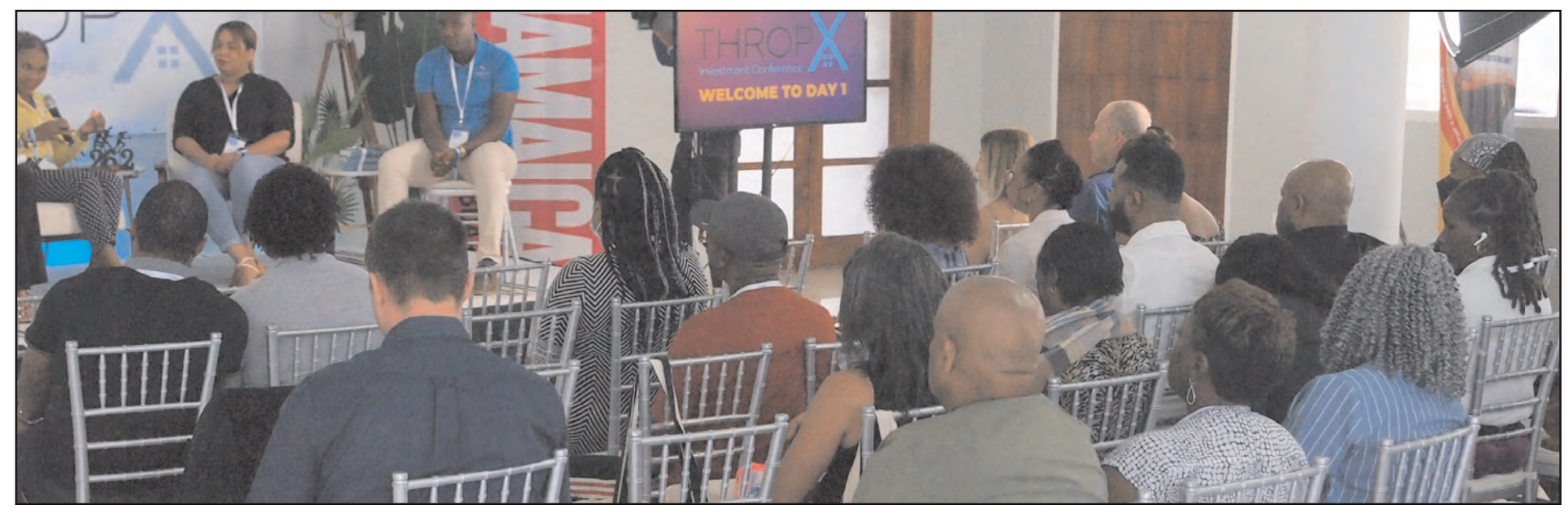
Participants at Throp X Conference 2022