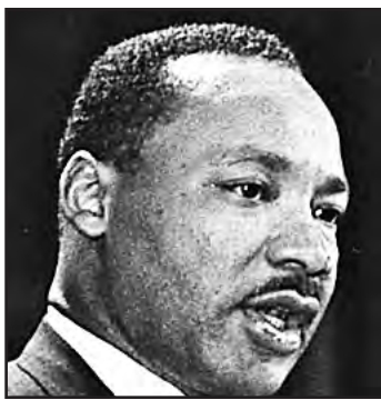
Dr. Martin Luther King Jr.