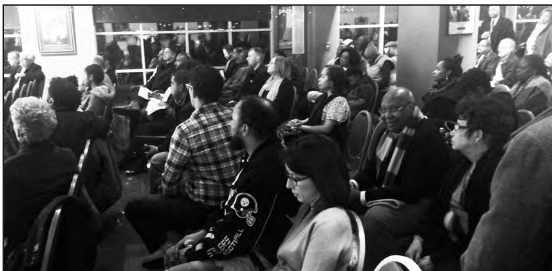
A section of the gathering: residents, business owners, stakeholders, and members of the Upper Albany Main Street organization in attendance at the hearing of the Route 44 Improvement Project