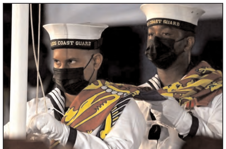
To signify the official change of power, a final salute was made to the British monarchy and the Royal Standard flag was lowered and replaced.