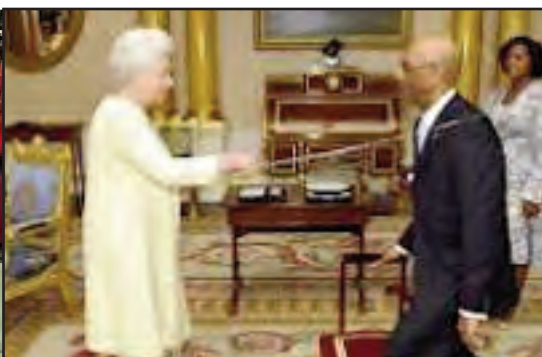
Queen Elizabeth invested Jamaica's Gov-General His Excellency the Most Hon. Sir Patrick Allen as knight.