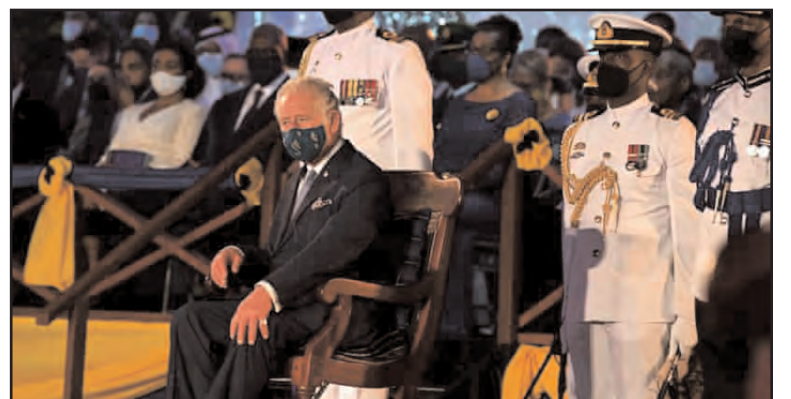
In his speech, Prince Charles acknowledged the “appalling atrocity of slavery” Barbados suffered. The new era for Barbados ends Britain's centuries of influence, including more than 200 years when the island was a hub for the transatlantic slave trade.