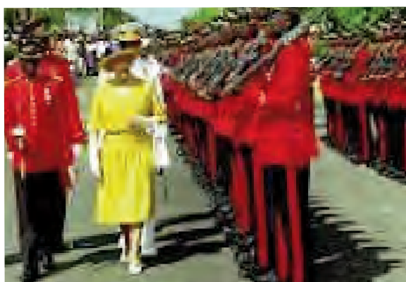
Queen Elizabeth's pre-independent Jamaica visit