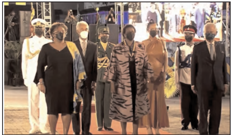
In an overnight ceremony in the capital, Bridgetown, Dame Sandra Mason, fourth from right, was sworn in as President. Prime Minister Mia Mottley, Sir Garfield Sobers, Barbadian singer Rihanna and The Prince of Wales, attended the event, which coincided with the country's 55th anniversary of Independence.

Will the monarchy respect the wishes and requests of the independent countries that were once colonies and return some of what was taken? Will the jewels be returned to the people of Ethiopia and India? Will the gold be returned to the countries of Africa? Just like how Antwerp is considered the Diamond capital of the world, yet does not have a single mine, in a similar way will it be said to become with Britain?