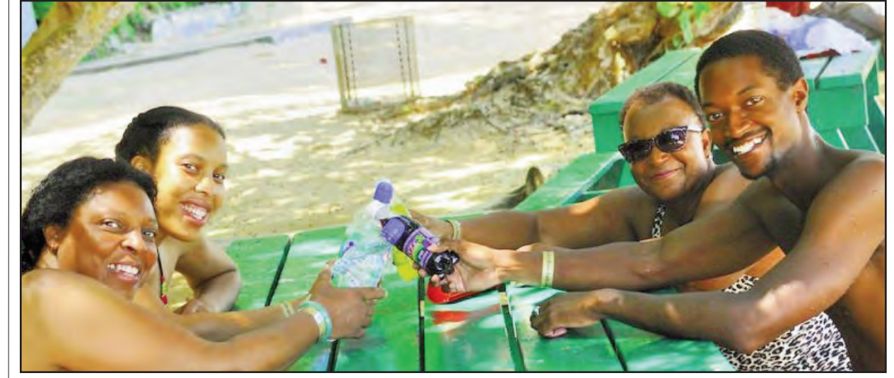
Afro-Americans in Jamaica

According to Coombs, we must change that pattern of spending and giving back to a cause, and the good feeling associated with community spirit.