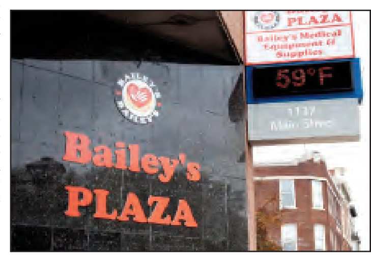
Bailey's Equipment and Supplies. East Hartford, Connecticut