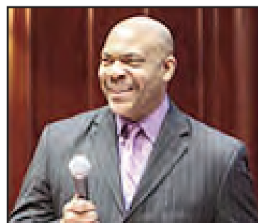
State Senator Doug McCrory

The renovations will overhaul interior spaces and building systems at all three schools to "like new" conditions and focus on improving instructional spaces, installing flexible seating options, and upgrading the schools' auditoriums. In all three cases, the state is